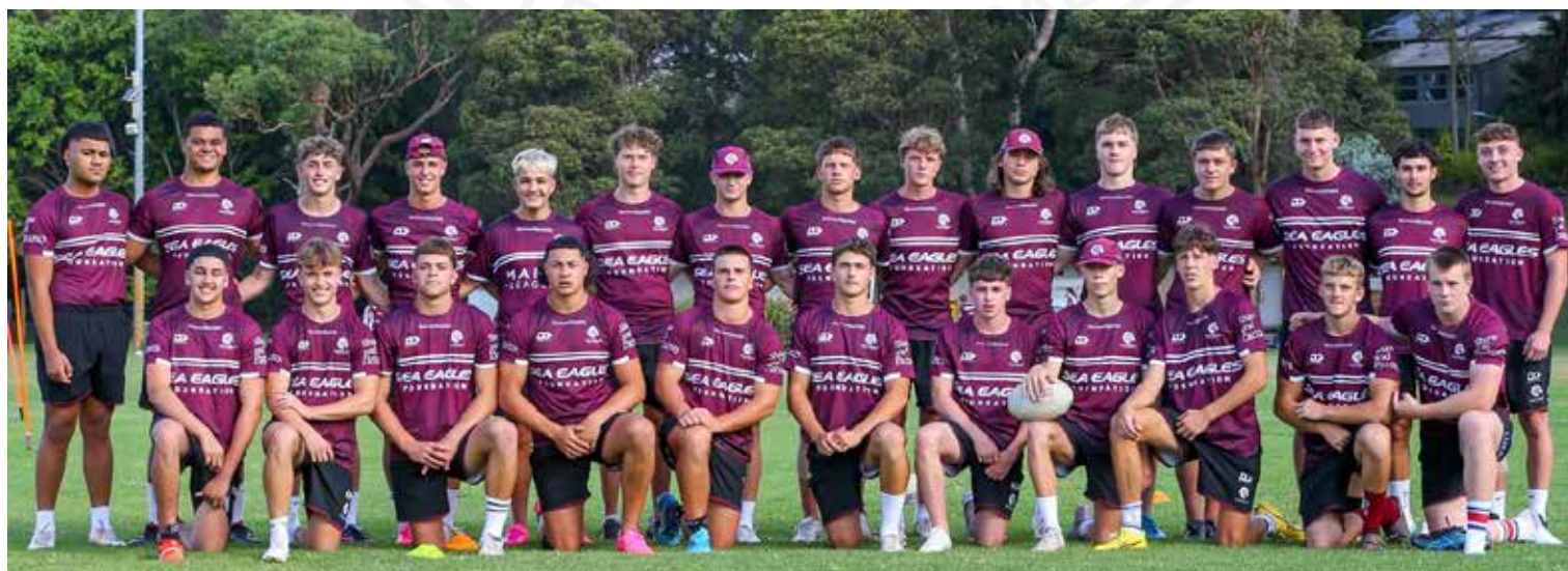
MANLY-WARRINGAH RUGBY LEAGUE FOOTBALL CLUB LIMITED ANNUAL REPORT 2024