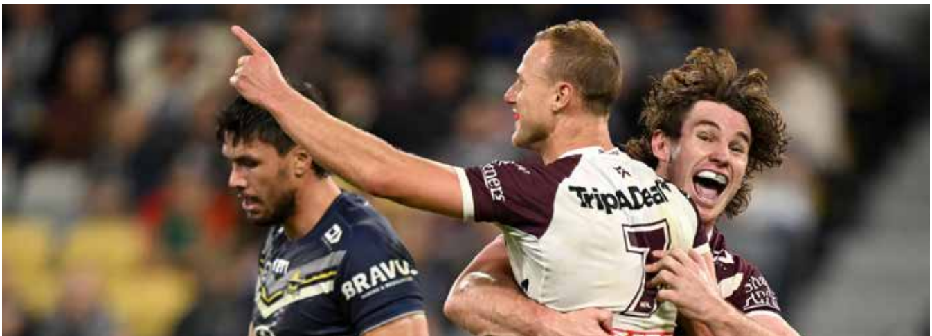
MANLY-WARRINGAH RUGBY LEAGUE FOOTBALL CLUB LIMITED ANNUAL REPORT 2024

* We mourn each and every Football Club member who passes away. We often don't hear of the passing of one of our members until sometime later - for example when we send an email. If we have omitted to note any member who has passed away, it is not intentional. We pass on our condolences to the family and friends of any member who has passed away in 2024.