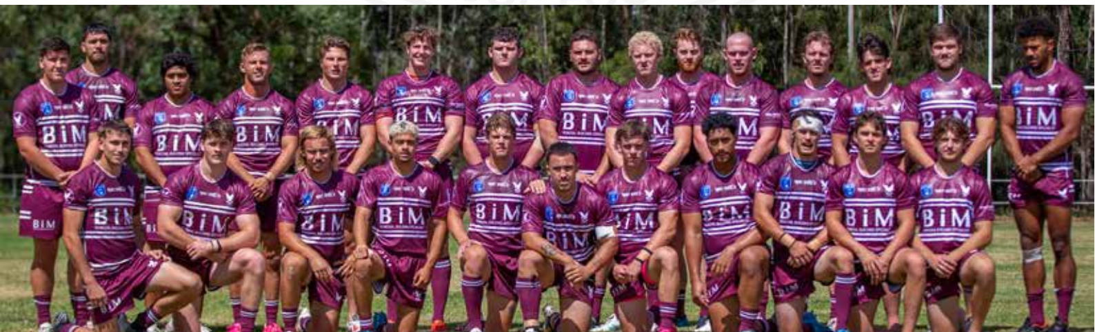
MANLY-WARRINGAH RUGBY LEAGUE FOOTBALL CLUB LIMITED ANNUAL REPORT 2024