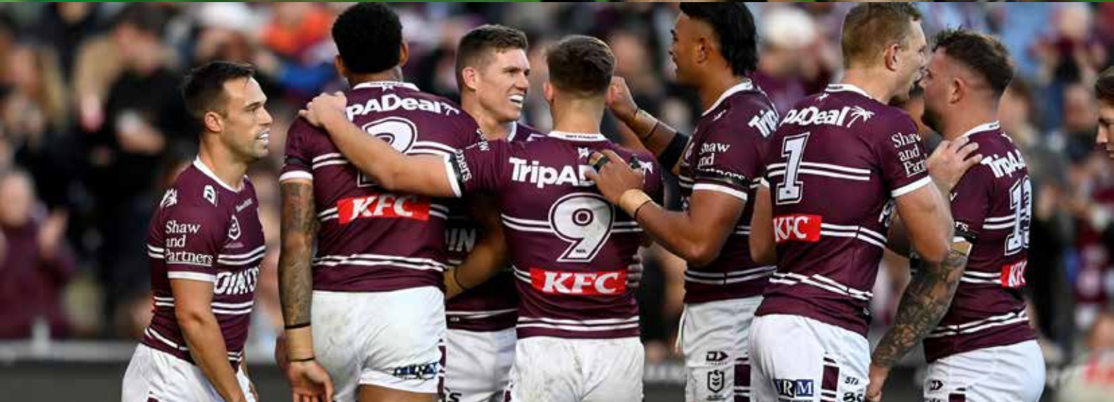
MANLY-WARRINGAH RUGBY LEAGUE FOOTBALL CLUB LIMITED ANNUAL REPORT 2024