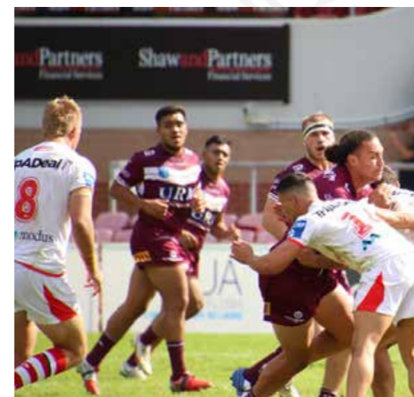
MANLY-WARRINGAH RUGBY LEAGUE FOOTBALL CLUB LIMITED ANNUAL REPORT 2021