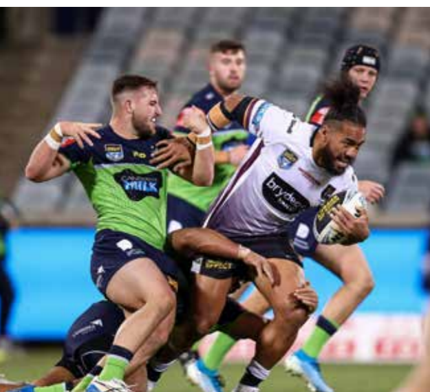
MANLY-WARRINGAH RUGBY LEAGUE FOOTBALL CLUB LIMITED ANNUAL REPORT 2021